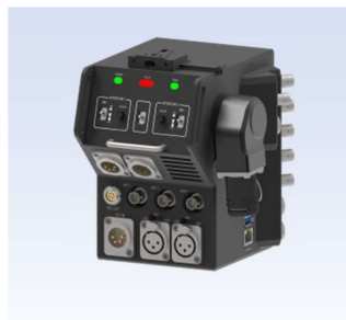
IVCA-8000 Fiber adapter