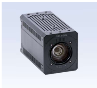
Incam micro camera