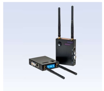
LCW-20 Wireless control